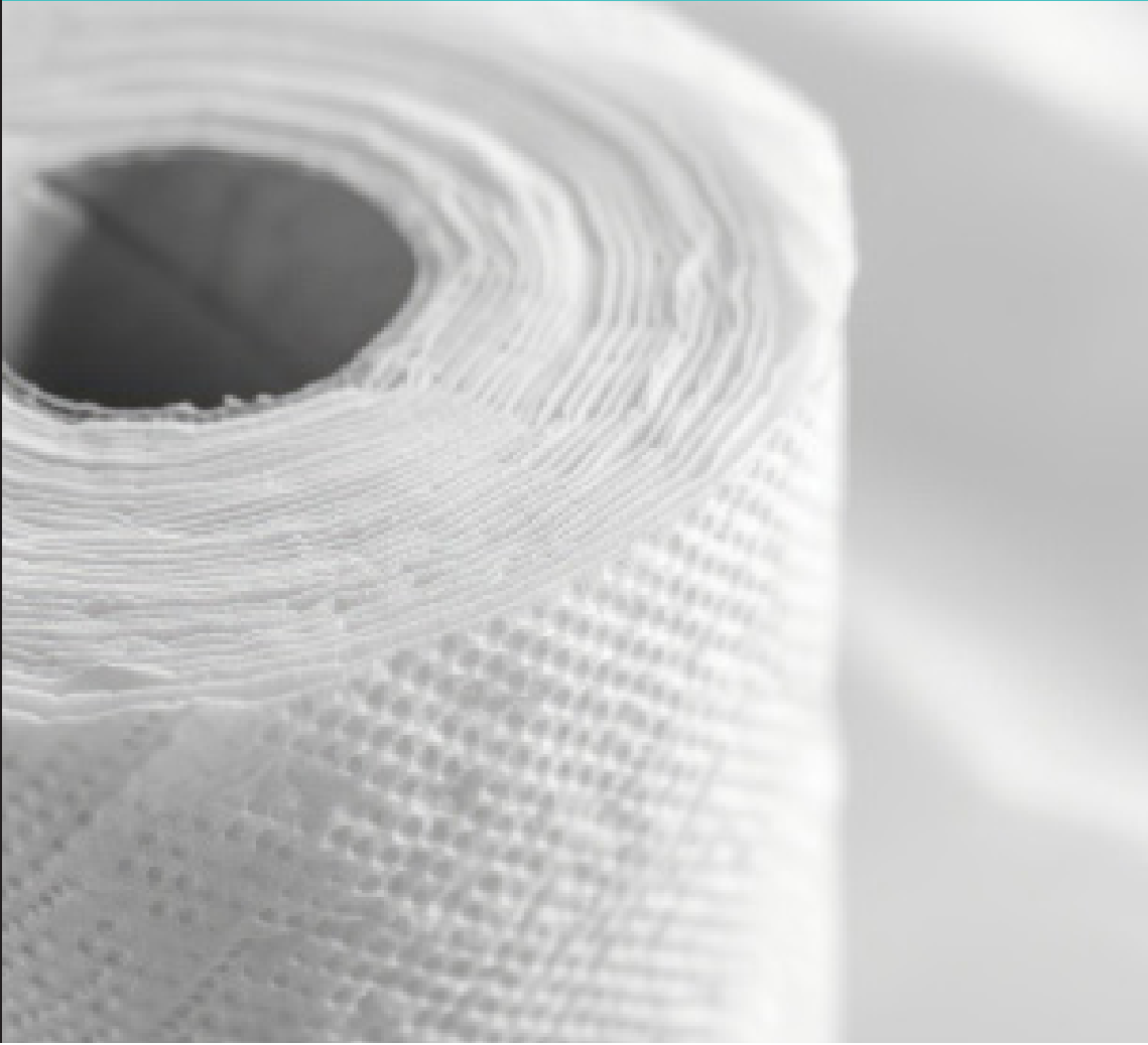
Disposable Bed Sheet Rolls

Rose Teb disposable bed sheet rolls are produced from soft and durable materials to maintain hygiene and prevent infection transmission in medical settings. These rolls are available in various sizes and easily fit hospital, clinic, and healthcare beds. Rose Teb disposable bed sheets, with their liquid absorption capability and tear resistance, are an ideal choice for ensuring patient hygiene and safety.